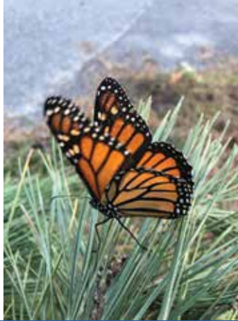
Cape May, NJ is a strategic layover for a 3,000 mile migration from Canada to Mexico during September and October.